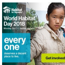
World Habitat Day