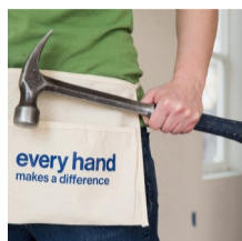
New Build Planned