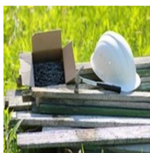
New Repair Program